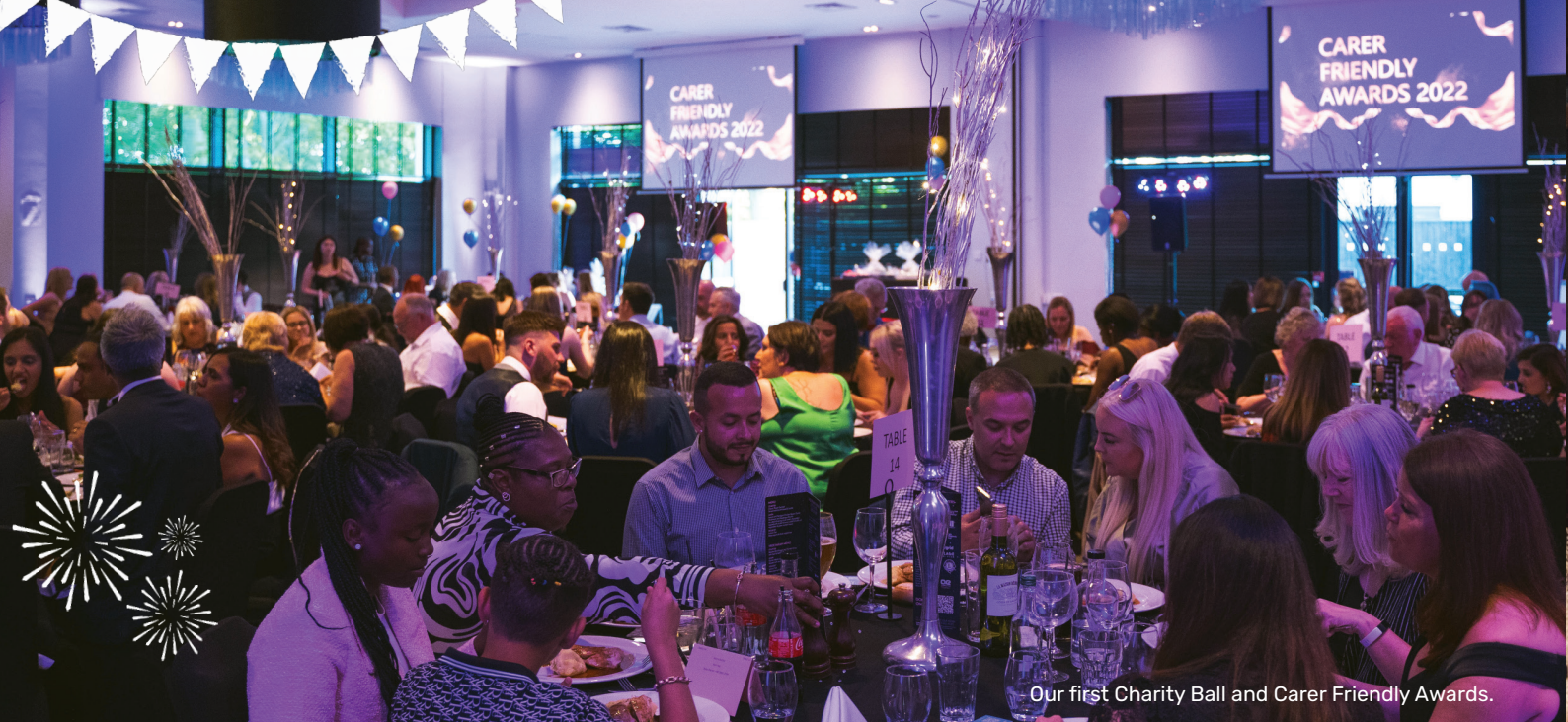
Our first Charity Ball and Carer Friendly Awards.