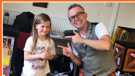
Magic Show for young carers.