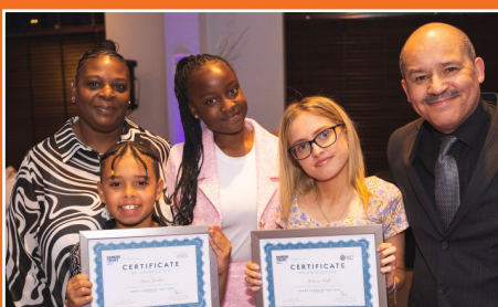
Award winning carers celebrate at our Charity Ball.