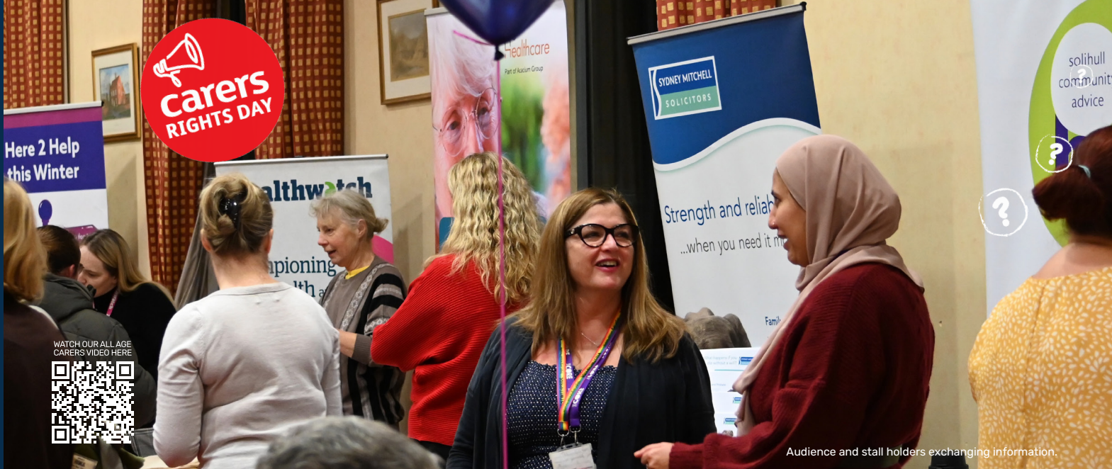
Audience and stall holders exchanging information.