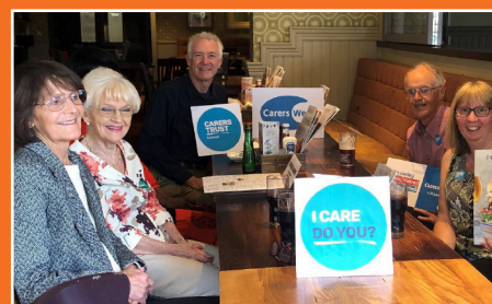
Carers celebrating the week with a meal.