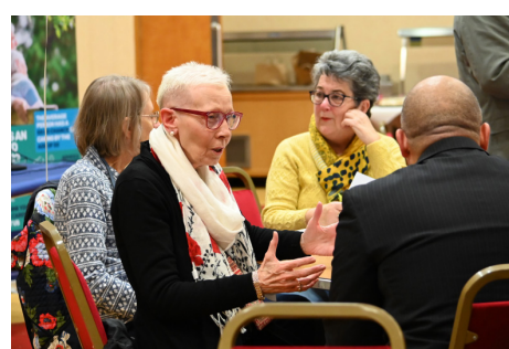
Audience of carers and others.