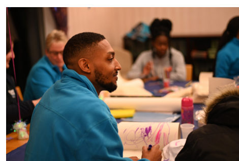
Activities for young carers led by YC's staff.

Our Cost of Living Information Event for Carers Rights Day in 2022 was hosted at Solihull Council's Civic Suite. We responded to the growing concern around energy prices and the cost of living crisis and had a special focus on 'keeping warm this winter'.