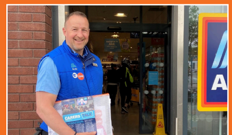
Staff at Aldi receive a pack to help support carers at work.